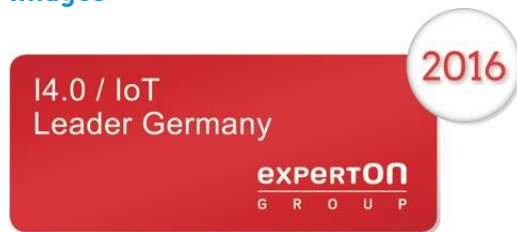
Experton's seal of approval: leader emblem